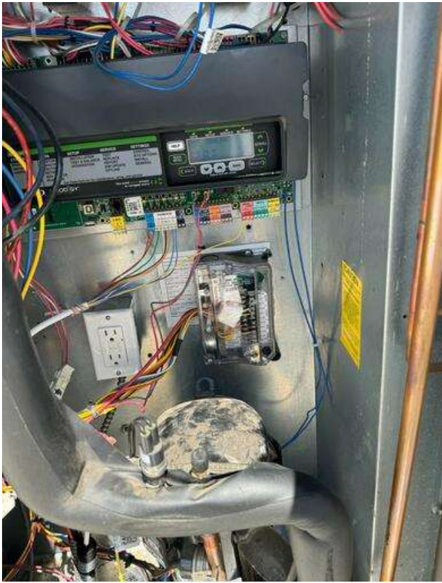
Pic 4 Aubrey Devonshire Jun 19, 2024 7:30 AM