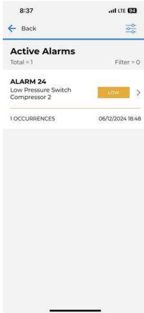
IMG_7008 Tyler Youells Jun 13, 2024 1:36 PM